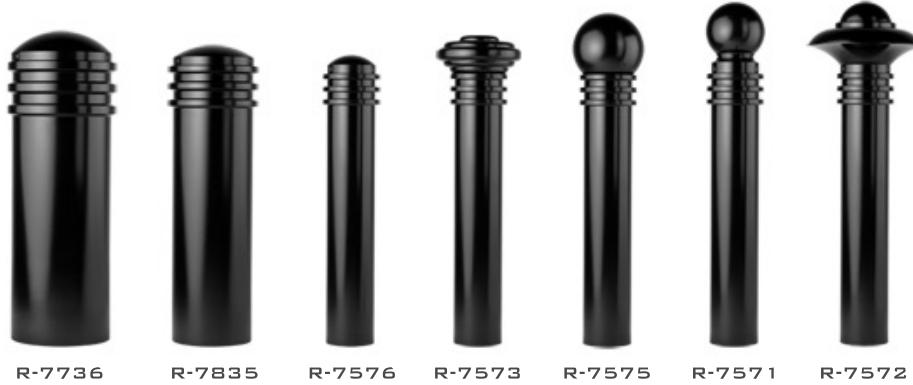
BOLLARD DIMENSION CHART